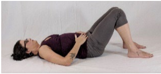
Belly Breathing in Constructive Rest