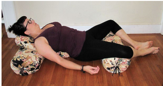
Supported Bound Angle with Hakini Mudra